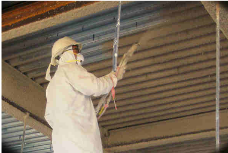
Figure 3. Spray applied fireproofing

umn is reduced, the load is transferred to the concrete fillings. However, this method significantly intensifications the weight of structural components (Buchanan, 2001).