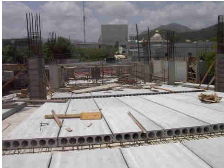
Figure 4. Hollow slab