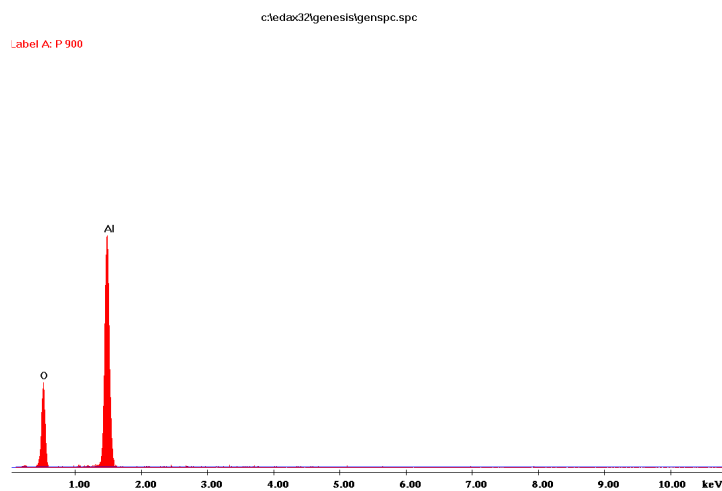
Figure 2. EDAX elemental analysis of alumina nanomaterial

The results indicates that nanomaterial synthesized is pure since in EDX graph are found only specific peaks for aluminum and oxygen (Figure 2)