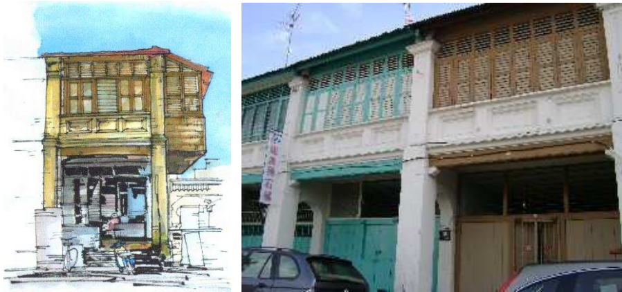
Figure 2. Facade of shop house of early transitional style

The two storey structures are built to the street edge and incorporate a five foot pedestrian walkway which is subsequently known as 'five footway' and is well entrenched in the style by the middle of the nineteenth century. Expressive gable ends to rows. Ornamentation is minimal with the upper consoles often enlarged and decorated with floral motifs, simple decoration to the spandrel. Green glazed ceramic vents) and plain pilasters [5]. The usual orders adopted are the Tuscan and Doric. Upper floor openings, with a row of continuous timber shutters are common. Cornices or horizontal mouldings along the beam make the structure appear heavy. Structurally, buildings of this style incorporate the use of masonry dividing walls with timber upper floor, tiled roof and timber beam. Figure 2 illustrates the facade of shop house of early transitional style