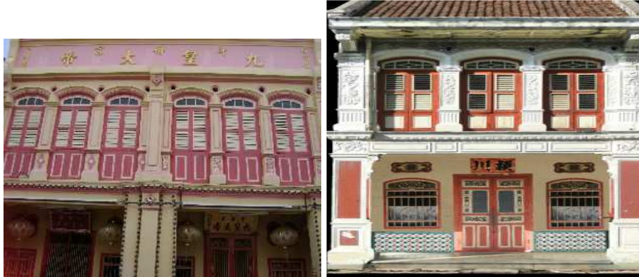
Figure 4. Facade of shop house of Late Straits Eclectic style.