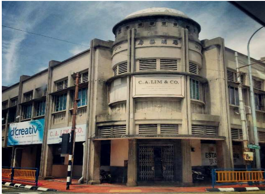
Figure 6. Facade of shop house of Early Modern style.

adapted to form a unique modern style. Structurally, the buildings of this style use reinforced concrete. Figure 6 demonstrates the facade of shop house of Early Modern style.