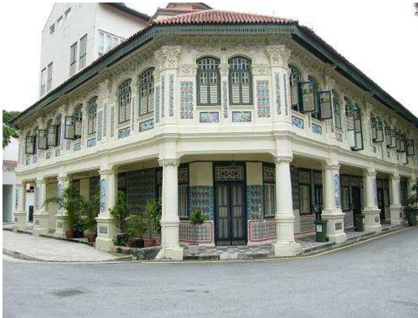
Figure 5. Facade of shop house of Art Deco style.

of construction on the facade of the building as well as the use of metal frame windows is typical of this period of architecture. Structurally, buildings of this style are or reinforced concrete masonry rendered or Shanghai plastered. Development or reinforced concrete resulted in cantilevered sunshades and high pediment or parapet wall. Figure 5 shows the facade of shop house of Art Deco style.