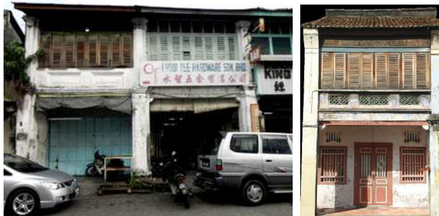
Figure 1. Façade view of shop house of Southern China style

first sultan married a princess from China. The Malaysian Chinese population is descended from the immigrants from the southern provinces of China [2]. They consist of several different clans including the Hakkas, Foochows, Hainanese, Teochius and Cantonese. During the British period in the early 19th century, the Chinese, who came to Malay Peninsula via Penang, Malacca and Singapore, were employed in tin mines and rubber estates. Some of them were hired in trades, as craftsmen and skilled mechanics, while others worked in sundry shops as shopkeepers [3]. Due to the discovery of tin fields between 1850 and 1870 in some parts of Perak and Selangor states, plus the increasing demand for tin ore in tinplate industry in Europe; a large number of them drastically, drifted to work in tin mines. The architectural tradition followed was a modified version of the "Chinese National". This is manifested in the symbolism of the ornaments that are used to convey luck, directions, seasons, the wind and constellations. The fundamental concept of design is courtyard, emphasis on the roof, exposure of structural element and colouring their building, floor finishes and others [4]. Normally the structure on this type of shop houses are plastered with lime and the roof structure are of timber. Figure 1 shows the façade view of shop house of Southern China style.